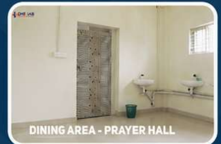
DINING AREA - PRAYER HALL