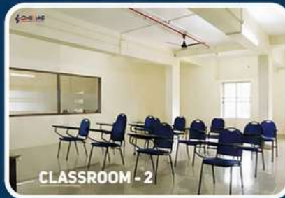
CLASSROOM - 2