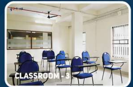
CLASSROOM - 3