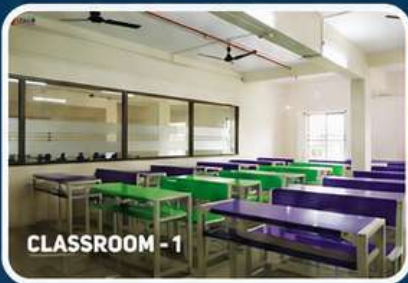
CLASSROOM - 1